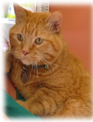
How can you say "no" to a smile like this? We don't, do we, Jersey Bumgarner?