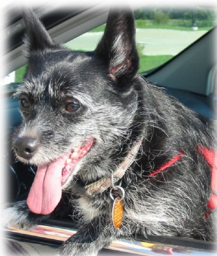
Rocky Reiners after early wellness check!